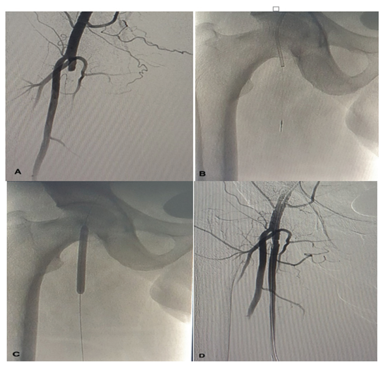
Right proximal SFA embolic occlusion treated by percutaneous-aspiration thrombectomy and balloon angioplasty. (a) Crossover diagnostic angiography showing total occlusion of proximal SFA (b). Using CAT eight and separator wire to aspirate the thrombus (c). Balloon angioplasty for residual stenosis (c). Final angiogram. SFA, superficial femoral artery.

obstruction in the arterial flow to the extremity owing to arterial embolism or in situ intra-arterial thrombosis, bypass graft thrombosis, acute aortic dissection, popliteal artery entrapment syndrome, adventitial disease, lower-limb vascular trauma, phlegmasia cerulea dolens, ergotism, hypercoagulable states, and iatrogenic complications related to cardiac catheterization, or other endovascular procedures [5]. Embolic events result in a greater degree of ischemia than acute thrombosis. The embolus usually lodges in the affected limb that is previously healthy with no prior collateral circulation; on the contrary, an in situ thrombosis occurs in vessels with prior, gradual atherosclerotic stenosis that has stimulated the formation of collateral vessels. The presence of these