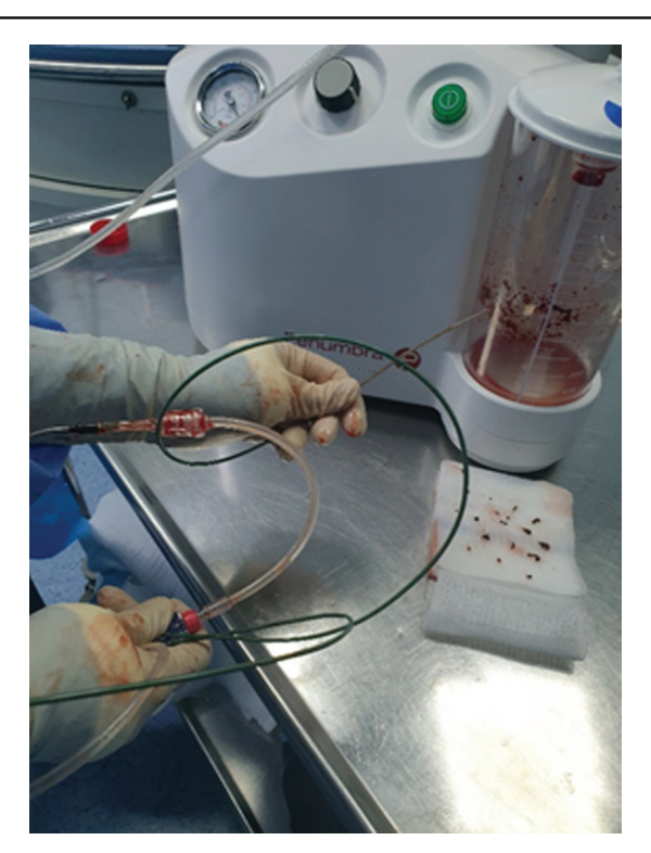
Indigo (Penumbra) aspiration system.