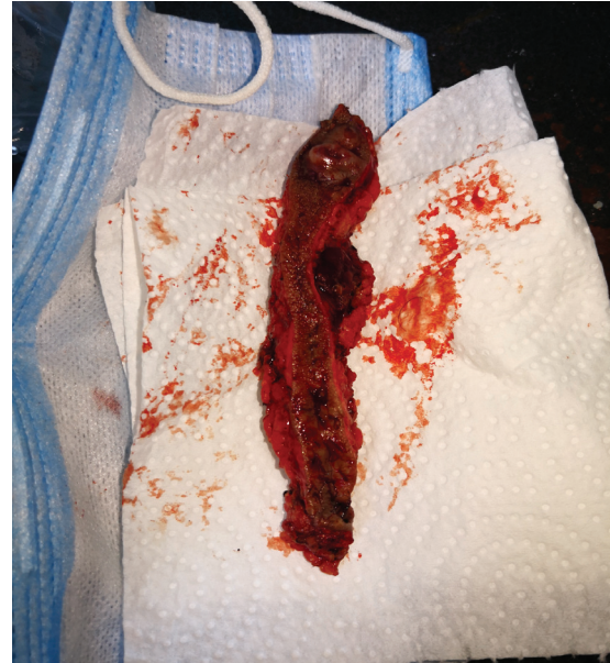
Minimally excised PNS track (original). PNS, pilonidal sinus.