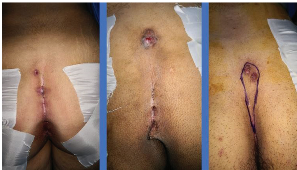
Varieties of PNS (original). PNS, pilonidal sinus.