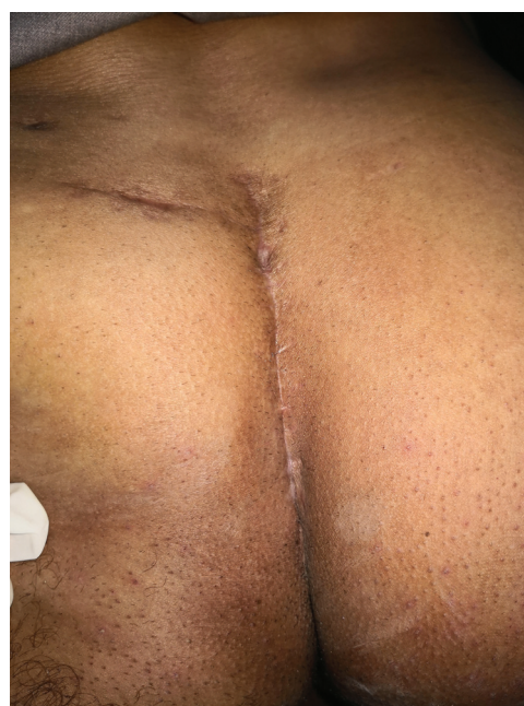
Healed wound with primary intention (original).