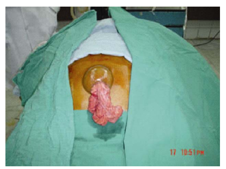
Figure1: 1 A case of ruptured umbilical hernia with prolapsed omentum