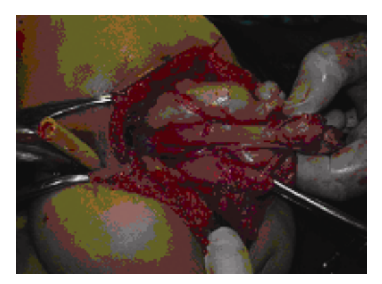
Figure 3: Tumor excision through PSA.