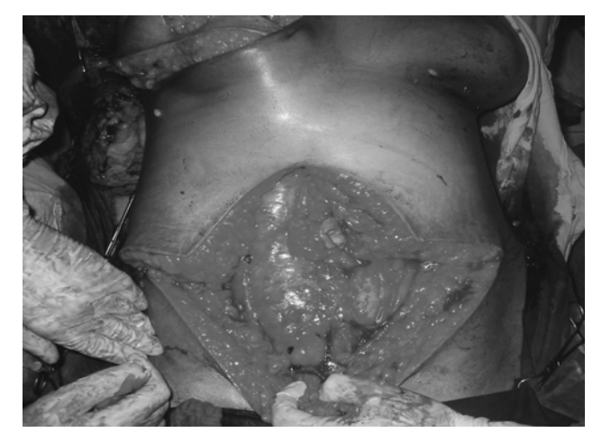
\label{eq:fig14.} \textit{Intraoperative mobilization of TRAM flap to the recepient site}