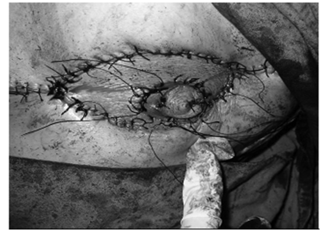
Fig 4. Intraoperative after completion of the LDM flap with nipple and areola reconstruction