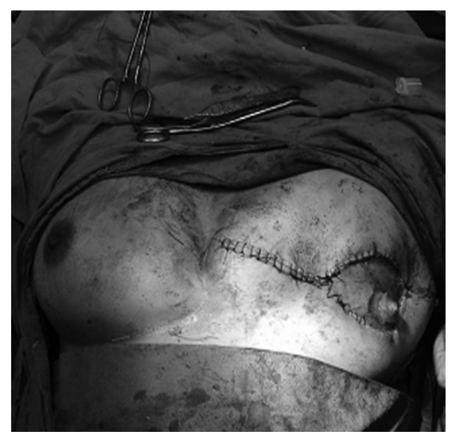
Fig 5. Immediate postoperaive picture of LDM flap and nipple reconstruction \,