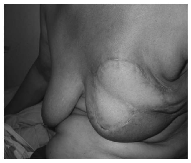
Fig 11. Lat view of the same patient