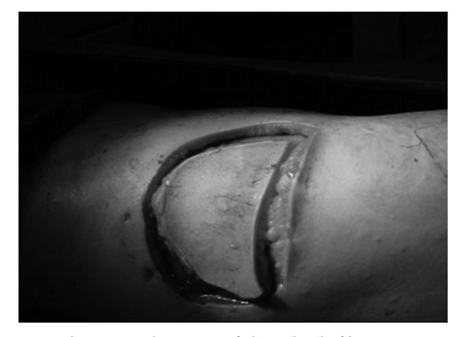
Fig\ 2.\ Planning\ and\ creation\ of\ skin\ island\ of\ latissmus\ dorsi\ myocutaneous\ flap