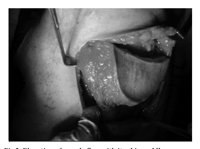
Fig 3. Elevation of muscle flap with its skin paddle