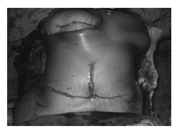
Fig 15. Immediate postoperative photo of TRAM flap and abdomioplasty wound