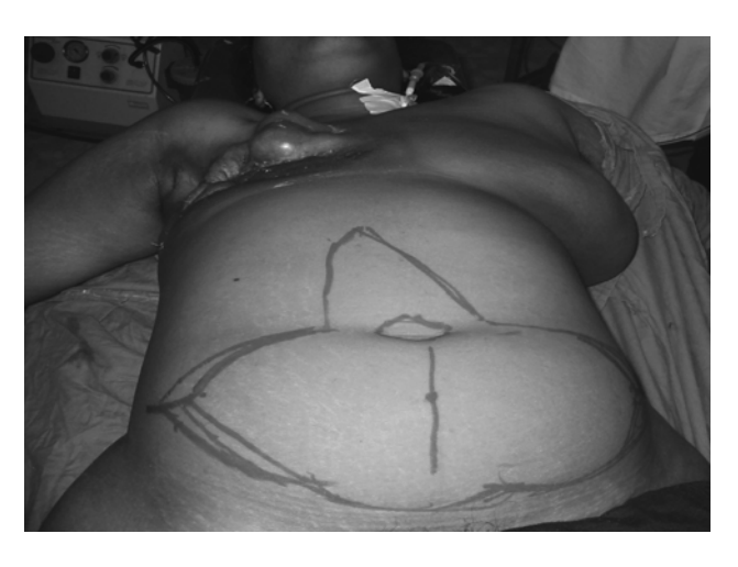
Fig 13. Modified TRAM flap: Fleur De Lys pattern