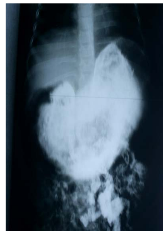
Fig 1. Barium meal radiography showing intragastric mass.