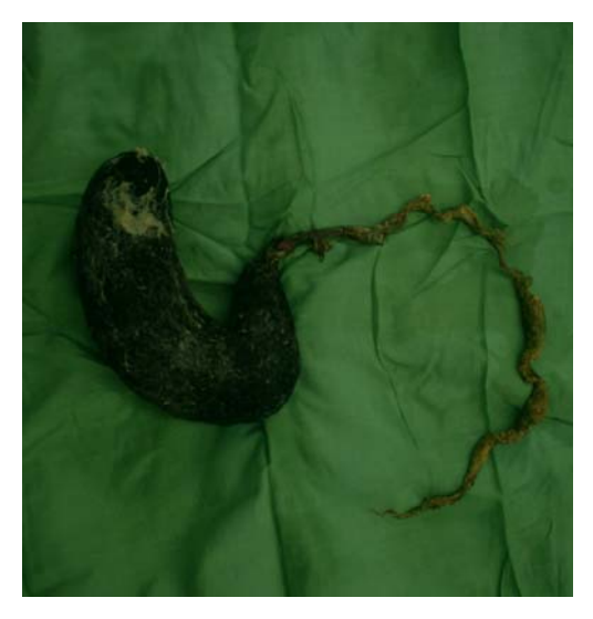
Fig 2. Surgically extracted trichobezoar; showing a cast of stomach, duodenum and part of jejunum.

the abdominal cavity by packs to minimize contamination and peritonitis from intra gastric contents (slimy, foul and putrid trichobezoar). At the time of laparotomy, careful inspection and palpation of the intestine to exclude possible extension of the trichobezoar through it (Rapunzel syndrome) which may cause postoperative intestinal obstruction.(6-8) The complications of trichobezoar include gastric or intestinal obstruction, intussusception, ulceration, perforation, hemorrhage, peritonitis and rarely obstructive jaundice when the bezoar obstructs the papilla.<sup>(8,9,11)</sup> The reported operative mortality is almost zero in patients who were diagnosed and treated in time without complications, but the mortality rate increases to about 20% in the presence of complications. Trichobezoar extending to the intestine (Rapunzel syndrome) may fragment, detach and lodge distally to present with intestinal obstruction, ulceration, perforation and peritonitis.(9,11) Follow-up during one year for the first case and 6 months for the second, revealed no recurrence of bezoar formation suggesting that surgery is traumatic enough to prevent patients habit of hair ingestion.