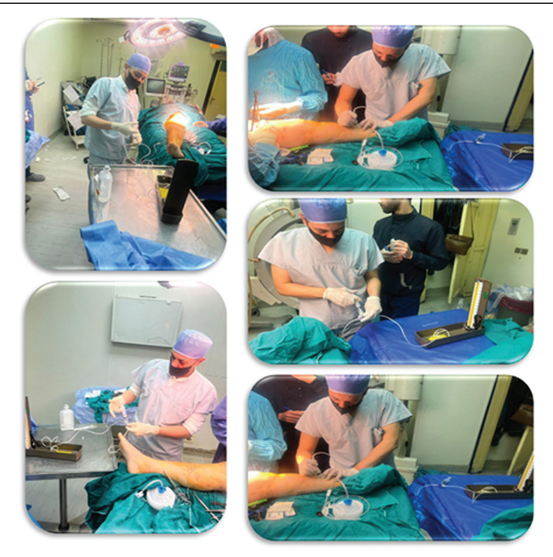
ICP was measured using an 18-G bevel-tipped needle with Whitesides method. ICP, intracompartmental pressure.

for the Social Sciences, New Orchard Road, Armonk, New York 10504-1722; US). The Kruskal–Wallis, Wilcoxon, \chi^2 , logistic regression analysis, and Spearman's correlation tests of significance were applied. According to the kind of data (parametric and nonparametric) collected for each variable, data were presented, and an appropriate analysis was carried out. P values of 0.05 or below 5% were regarded as statistically significant.