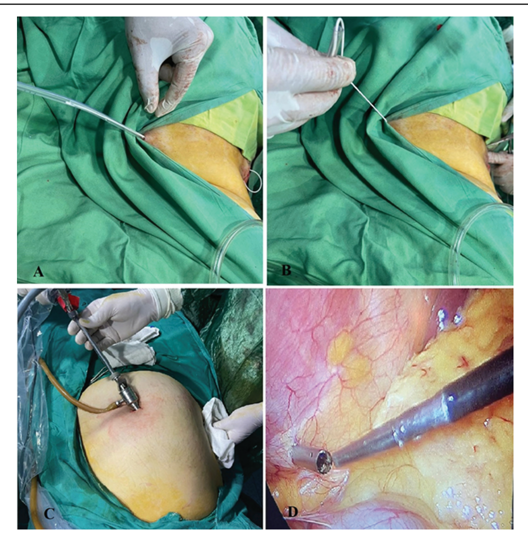
(a) Near complete passage of the feeding tube through the flank incision. (b) Complete passage of the LPS catheter through the flank incision. (c) Midline umbilical camera port and starting of the abdominal stage of procedure. (d) 5 mm trocar introduced through the mini flank incision through which long grasper is passed. LPS, lumboperitoneal shunt.

with closure of all wounds. The previous procedure was performed by the neurosurgeons with the assistance of the general surgeons mentioned in the authors' list of this manuscript.