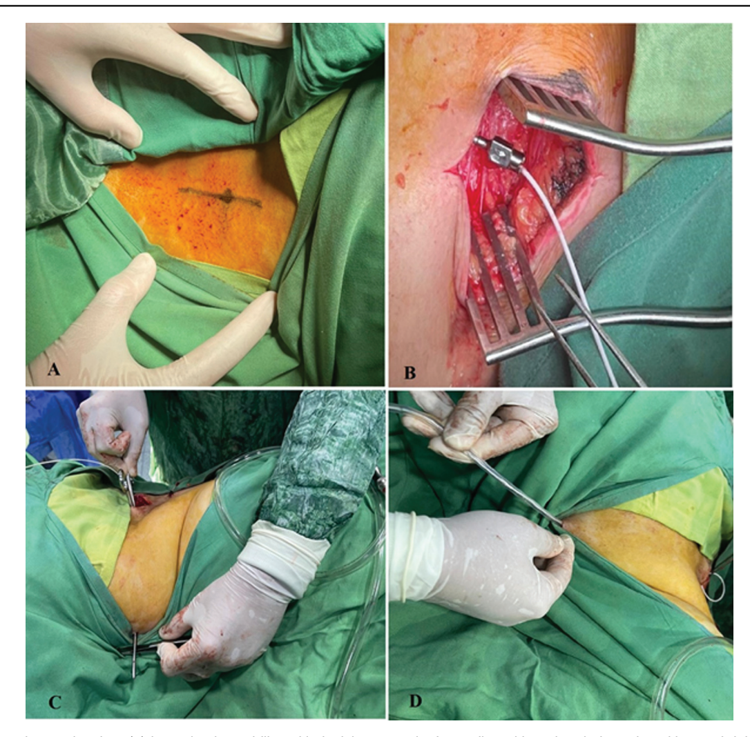
Intraoperative photos showing: (a) lower lumbar midline skin incision opposite L4–5 disc with patient in lateral position and right side up. (b) Insertion of spinal cannula inside the thecal sac then insertion of proximal end of LPS catheter after removal of trocar. (c) Starting of subcutaneous tunneling from midline back to flank incision with disc rongeur forceps. (d) Passage of elastic feeding tube through the tunnel with the distal end of LPS catheter inside. LPS, lumboperitoneal shunt.

a long grasper was inserted through the working port at the left side to exit through the right flank one, and then the distal end of the shunt catheter was grasped into the abdominal cavity, and fixed to the peritoneum by continuous sutures (Figs 3 and 4). After that, the surgeon changed his position to stand in between the patient legs, the first assistant on the right side of the operator and the camera man on his left side.