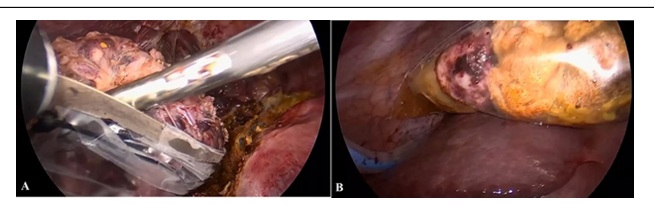
Extraction of the cyst through the laparoscopic port in an endobag.