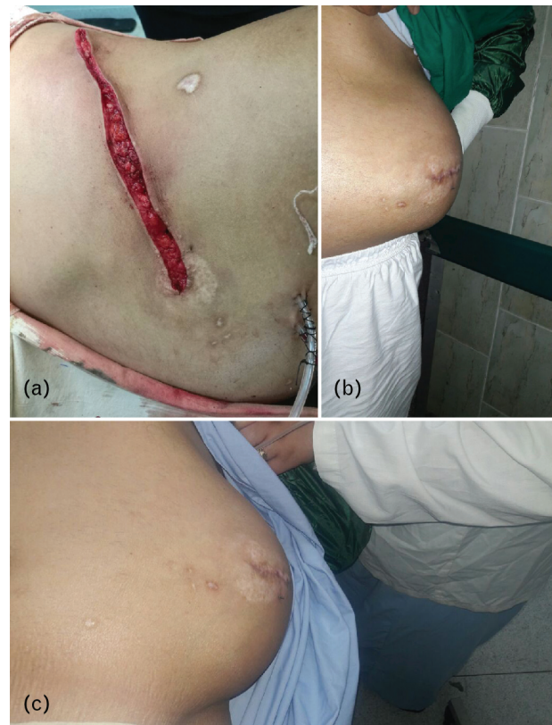
Preoperative lumbar incisional hernia. (a) A male patient with lumbar incisional hernia; (b) a huge bulge in anterior view; (c) lateral view.

obstruction, which results in hydronephrosis [8]. Most patients are presented as a nonemergency situation, and only 9% are presented with surgical emergencies [9]. Proximal intraoperative nerve injury might lead to a defect in the innervation of the abdominal wall muscles, which will lead to a subtype of lumbar hernia [5].