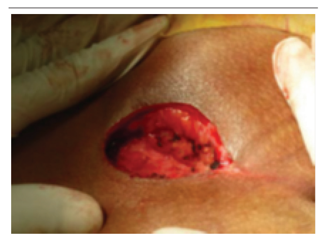
Open method (excision of boat-shaped wedge of tissue including the whole sinus)